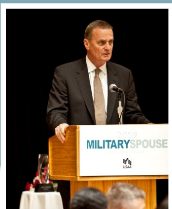
National Security Advisor, Gen. James Jones speaking at the 2009 MSOY Luncheon

Military Spouse influences ... The military spouse community is rallying behind Military Spouse. Military Spouse's web brand, MilSPOUSE.com, has become an online juggernaut with massive traffic growth to its forums, tips and blogs. Military Spouse magazine (MSM) has a deep penetration into the recession-proof military market. Additionally, the media coverage of the event has and continues to grow. The 2009 MSOY was featured on CNN's "Lou Dobbs Tonight," and various news outlets, in and out of the military community.